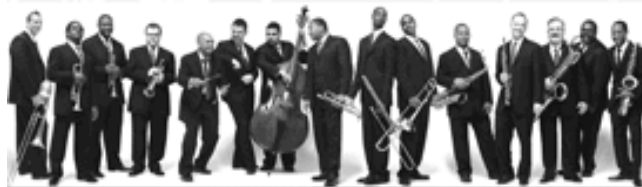
Jazz at Lincoln Center Orchestra with Wynton Marsalis