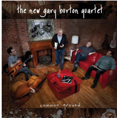
JULIAN LAGE GROUP